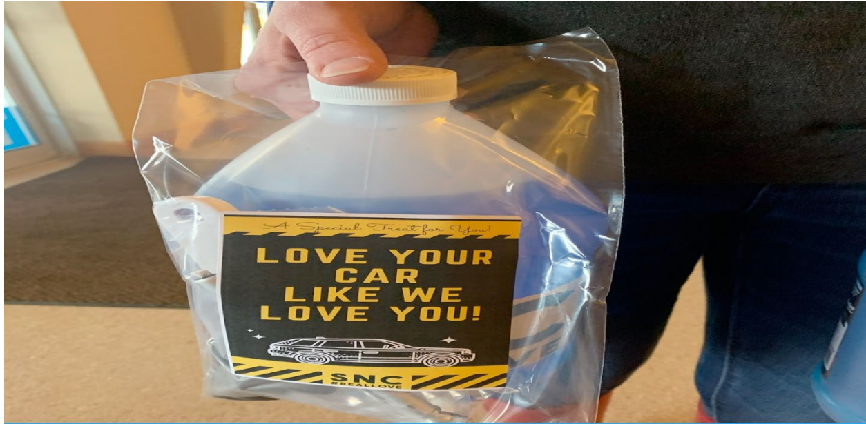
Car Care Kit