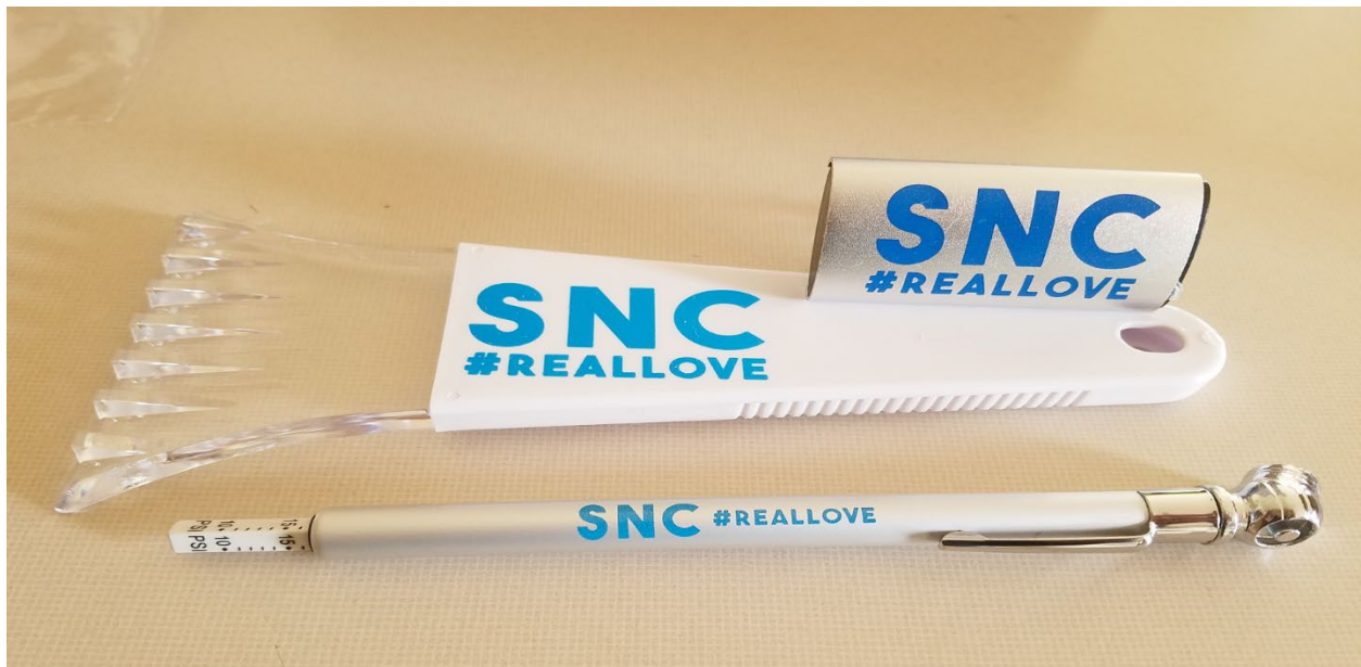
Car Care Kit

In January we put together an SNC car care kit. Each kit had windshield wiper fluid, an ice scraper, air freshener and tire gauge. We left these on porches throughout Seymour.